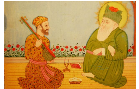
Image: Khusrow in conversation with Sufi saint Nizamuddin Auliya

This generation of loss dawdles on, with broken fragments of the past tinted with socio-political reengineering, trying to find pieces that fit the puzzle of our identity.