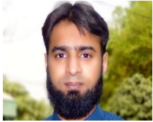
Finance and Administrative Wing