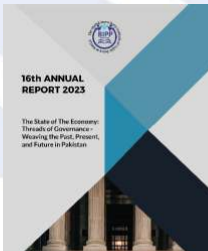
The Shahid Javed Burki Institute of Public Policy at Netsol